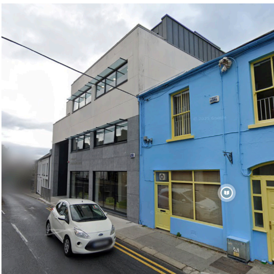
Wicklow entrance doorway